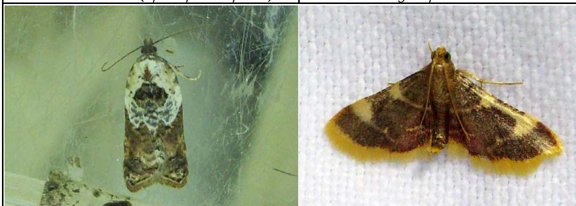
1048 Garden Rose Tortrix ( Acleris variegana )