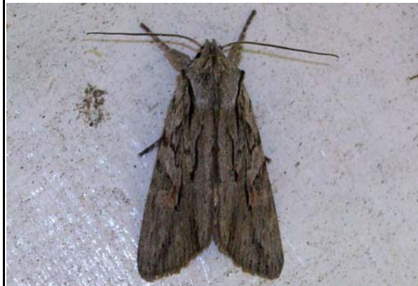
2240 Blair's Shoulder-knot ( Lithophane leautieri )