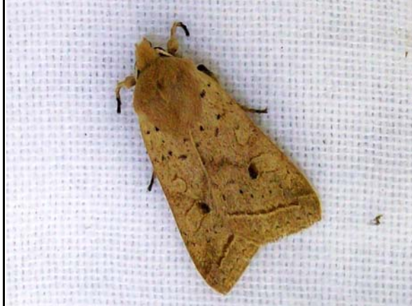
2264 Yellow-line Quaker ( Agrochola macilenta )