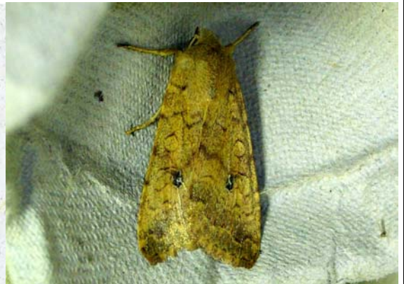
2262 Brick ( Agrochola circumcellaris )