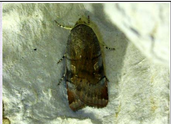
2111 Lesser Broad-bordered Yellow Underwing ( Noctua janthe )