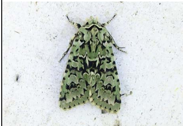
2247 Merveille Du Jour ( Dichonia aprillina )