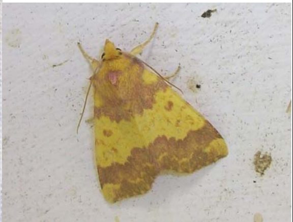
2272 Barred Sallow ( Xanthia aurago )