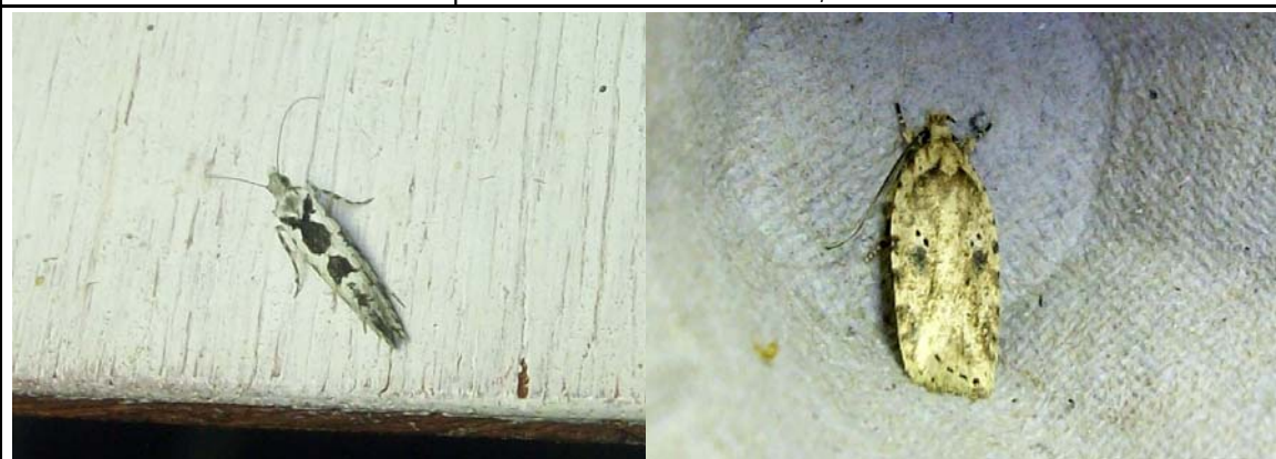
462 Rabbit Moth ( Ypsolopha sequella )