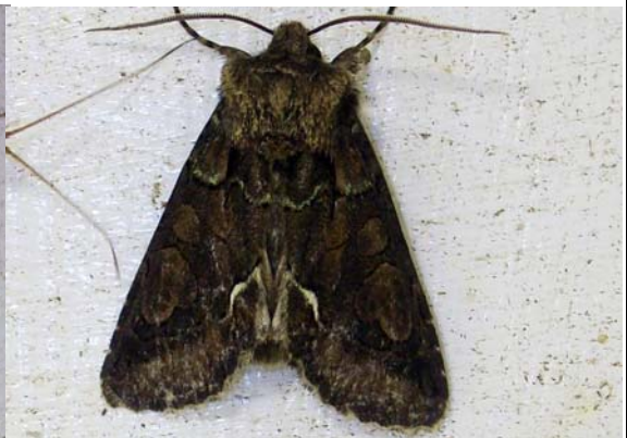
2245 Green-brindled Crescent ( Allophyes oxycanthae )