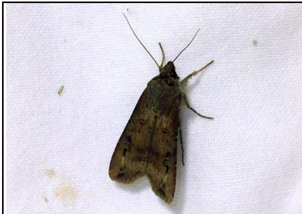
2091 Dark Sword-grass ( Agrotis ipsilon )