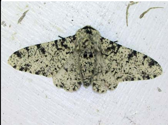
1931 Peppered Moth ( Biston betularia )