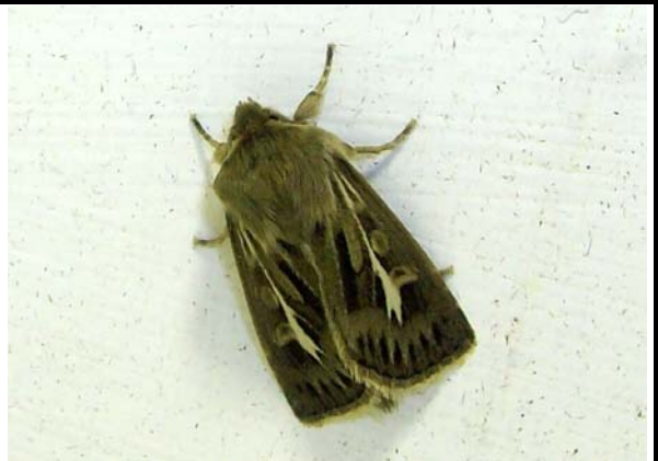
2176 Antler Moth ( Cerapteryx graminis )