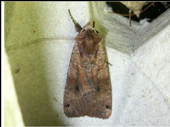
2130 Dotted Clay ( Xestia baja )