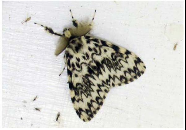
2033 Black Arches ( Lymantria monacha )