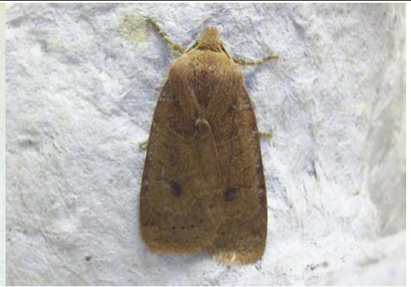
2258 Chestnut ( Conistra vaccinii )