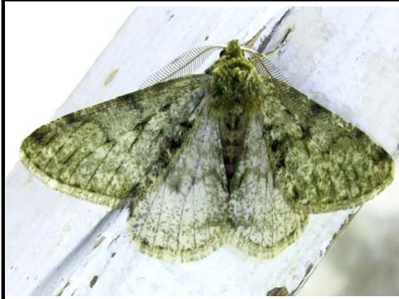
1926 Pale Brindled Beauty ( Phigalia pilosaria )