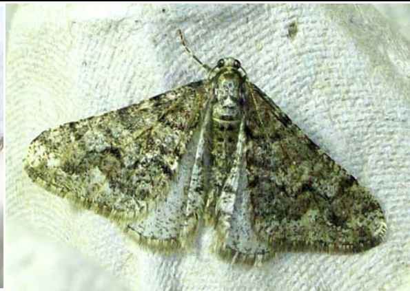
1932 Spring Usher ( Agriopsis leucophaearia )