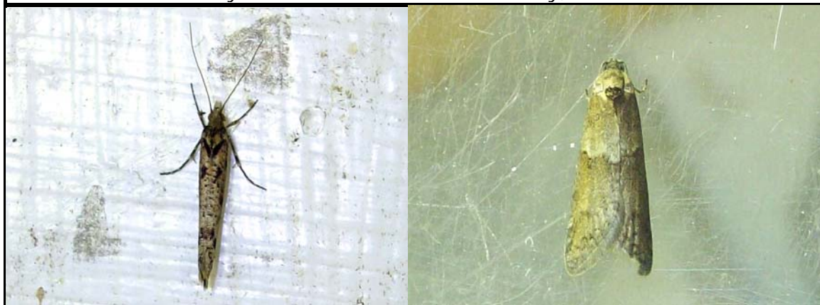
461 Ypsolopha ustella