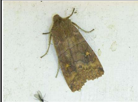
2256 Satellite ( Eupsilia transversa )