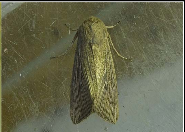
2204 Obscure Wainscot ( Mythimna obsoleta )