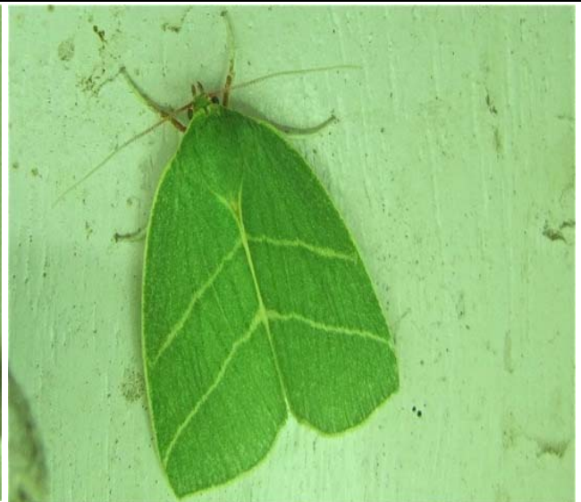
2421 Scarce Silver-lines ( Bena bicolorana )