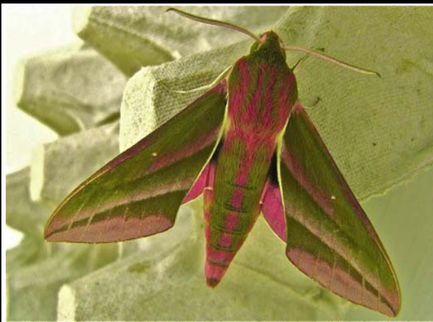
1991 Elephant Hawk-moth ( Deilephila elpenor )