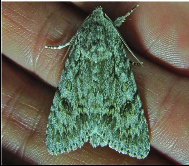
2279 Sycamore ( Acrionicta aceris )