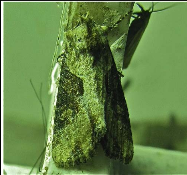
2336 Double Lobed ( Apamea ophiogramma )