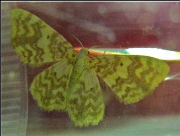
1876 Small Yellow Wave ( Hydrelia flammeolaria )