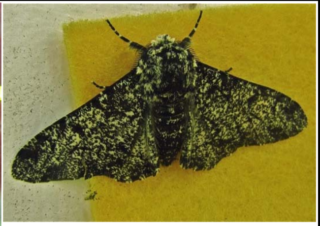
1931 Peppered Moth ( Biston betularia f. insularia )