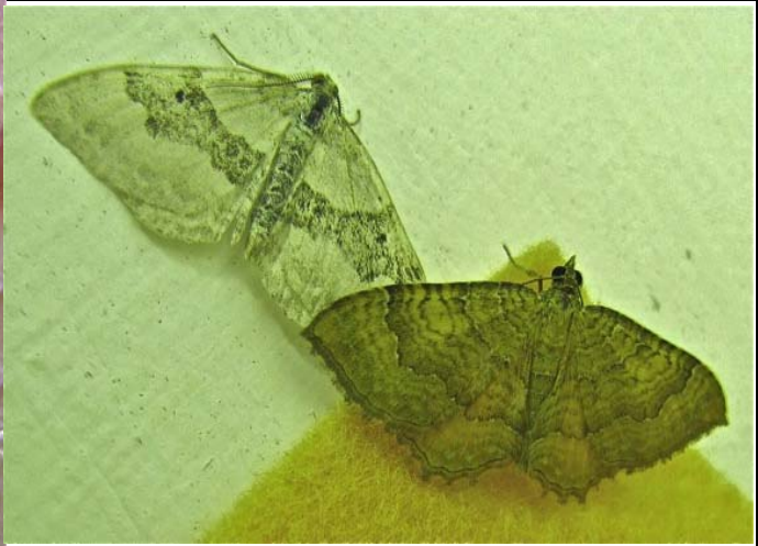
1727 Silver-ground Carpet ( Xanthorhoe montanata ) & 1742 Yellow Shell ( Camptogramma bilineata )