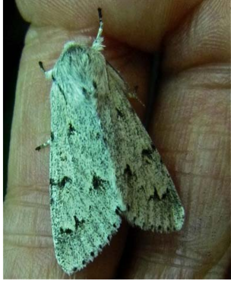
2280 Miller ( Acrionicta leporina )