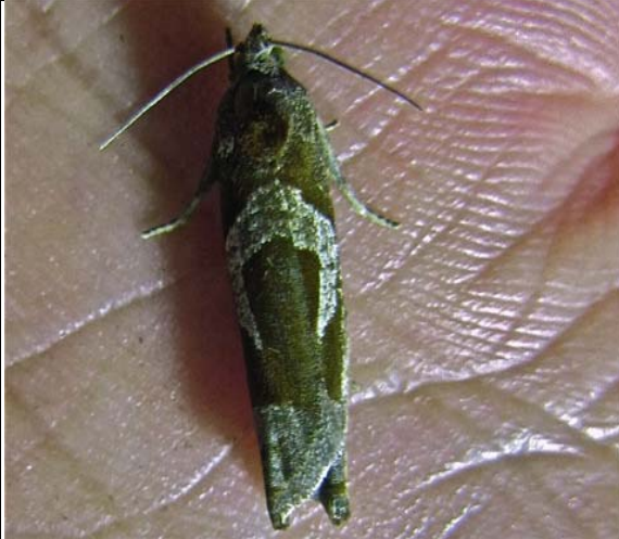
1183 Epiblema foenella

Abbey Farm Moths 12th July, 2013