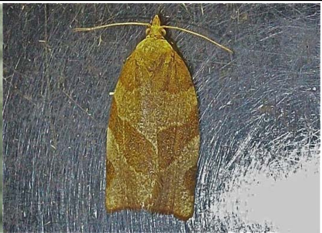
970 Barred Fruit-tree Tortrix ( Pandemis cerasana )