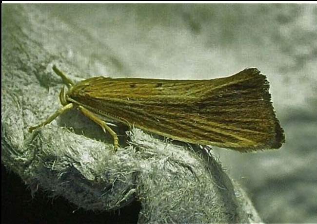
470 Orthotelia sparganella