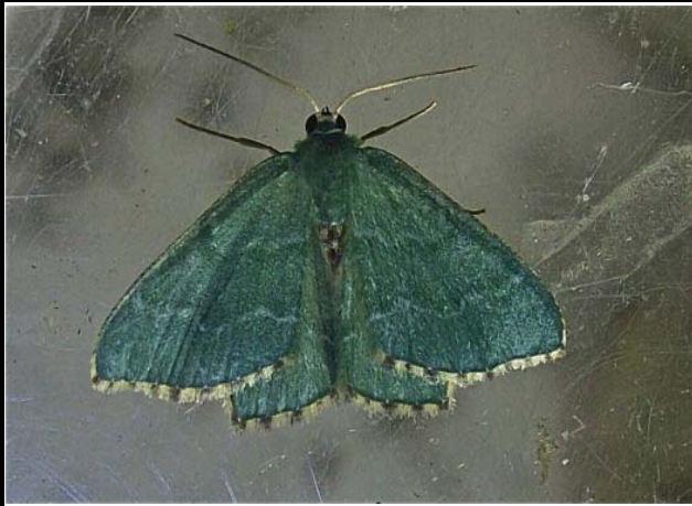
1669 Common Emerald ( Hemithea aestivaria )