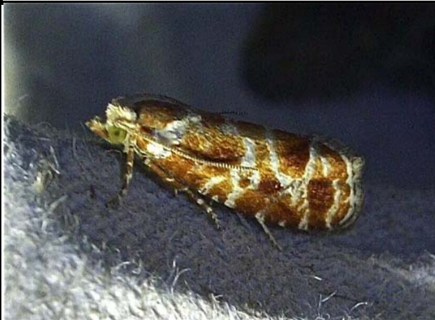
1211 Rhyacionia pinicolana