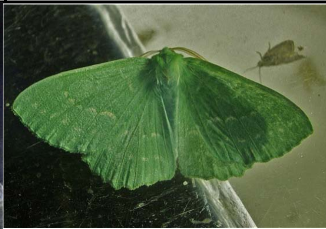
1666 Large Emerald ( Geometra papilionaria )