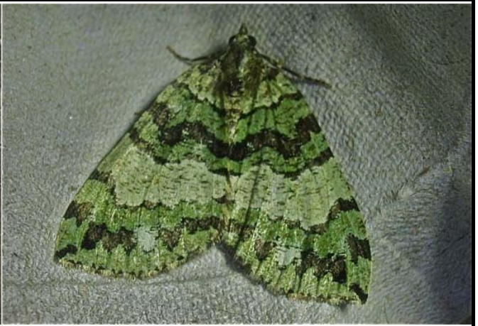
1777 July Highflyer ( Hydriomena furcata )