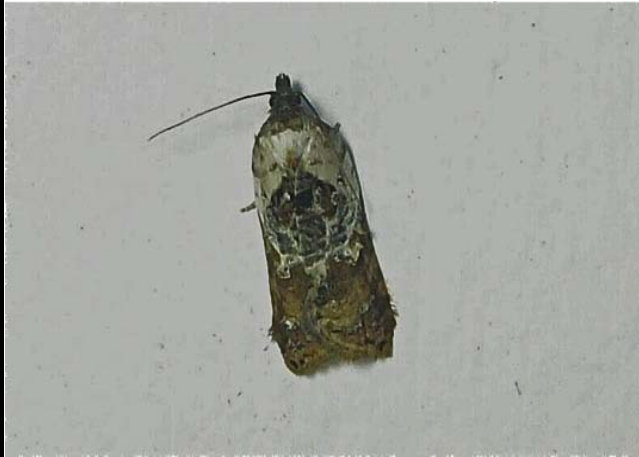
1048 Garden Rose Tortrix ( Acleris variegana )

Bishop's Hill Moths 20th September, 2013