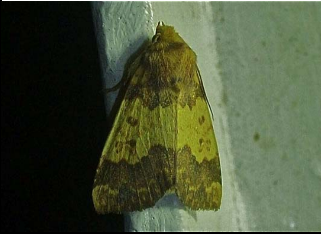
2272 Barred Sallow ( Xanthia aurago )