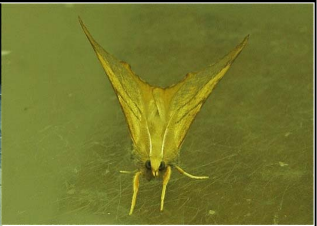
1914 Dusky Thorn ( Ennomos fuscantaria )