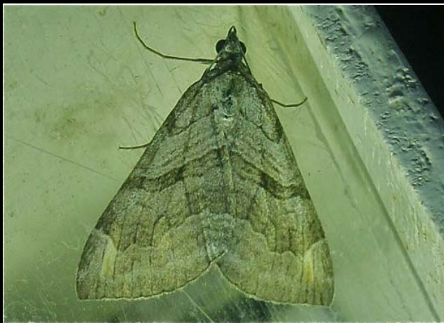
1868 Lesser Treble-bar ( Aplocera efformata )