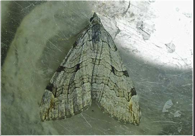
1867 Treble-bar ( Aplocera plagiata )