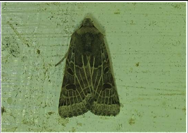
2270 Lunar Underwing ( Omphaloscelis lunosa )