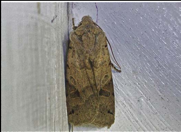
2266 Brown-spot Pinion ( Agrochola litura )