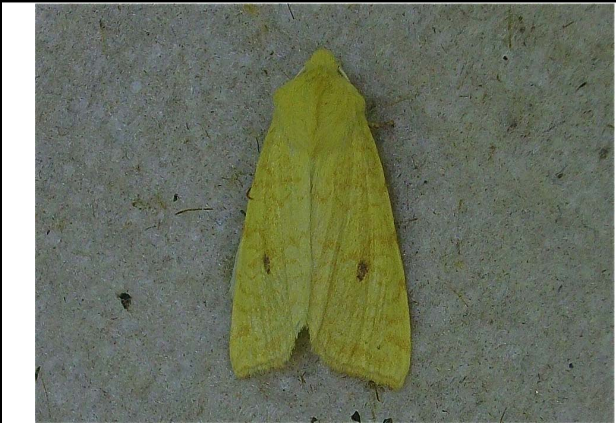
2274 Sallow ( Xanthia ictertia )