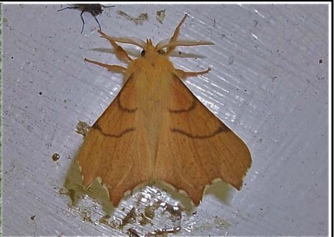
1912 August Thorn ( Ennomos quercinaria )