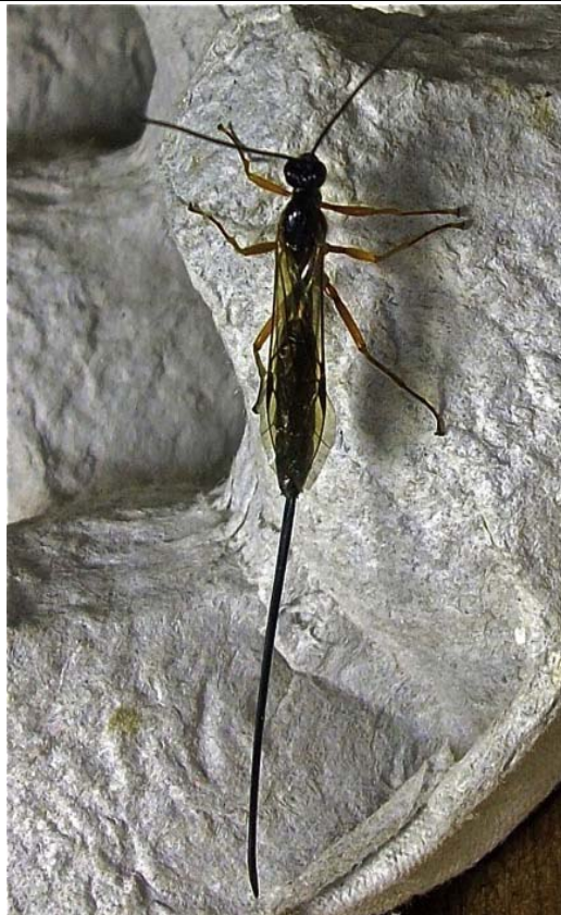
Ichneumon Wasp ( Rhyssa persuasoria )