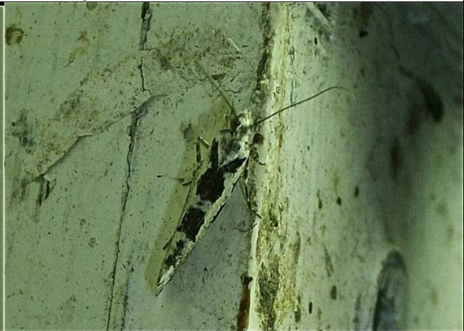
462 Rabbit Moth ( Ypsolopha sequella )