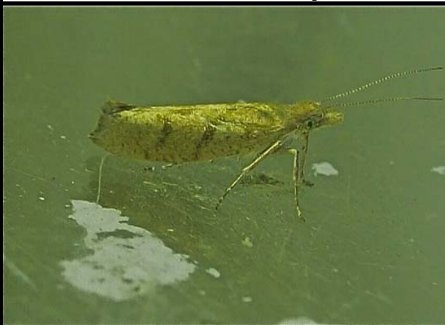
459 Ypsolopha sylvella