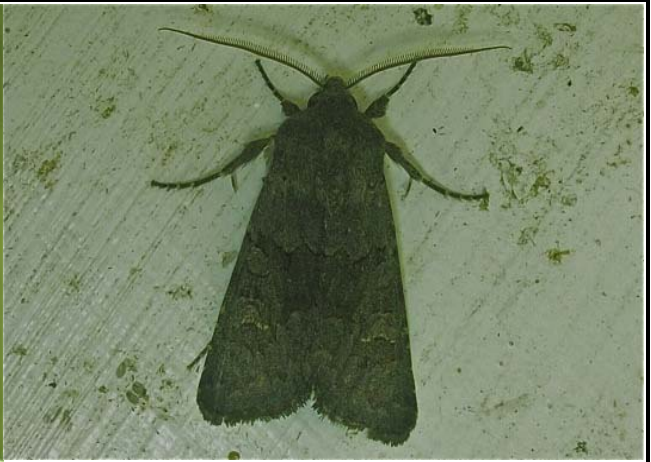
2231 Deep-brown Dart ( Aporophyla lutulenta )