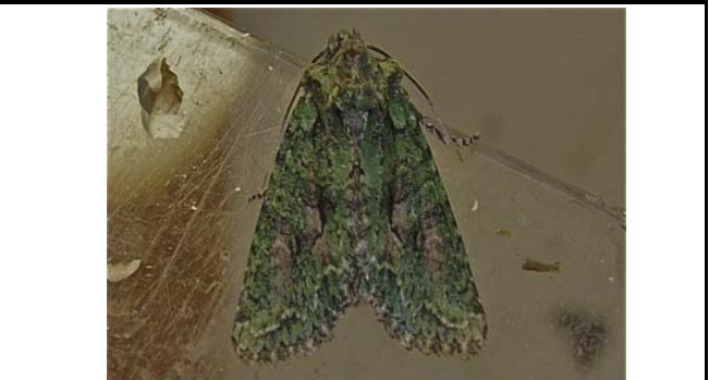
2248 Brindled Green ( Dryobotodes eremita )