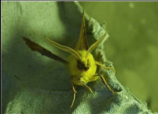
1913 Canary-shouldered Thorn ( Ennomos alniaria )