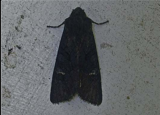
2232 Black Rustic ( Aporophyla nigra )