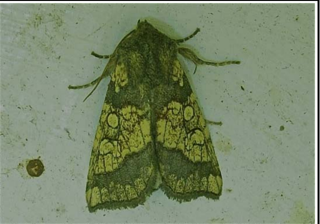
2364 Frosted Orange ( Gortyna flavago )