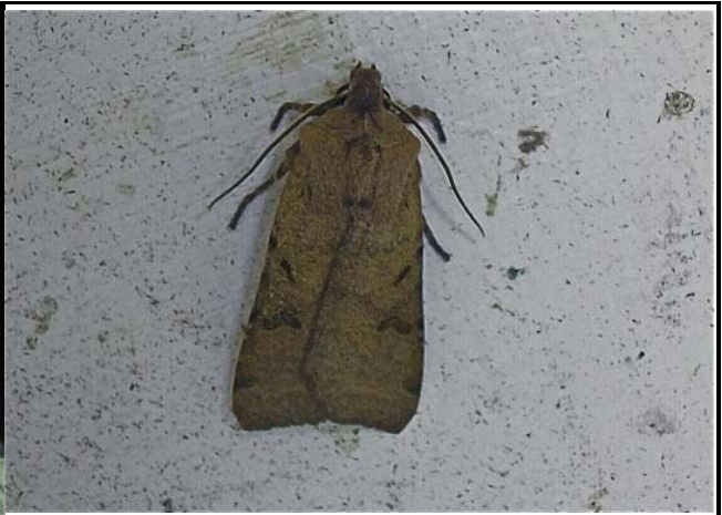
2267 Beaded Chestnut ( Agrochola lychnidis )