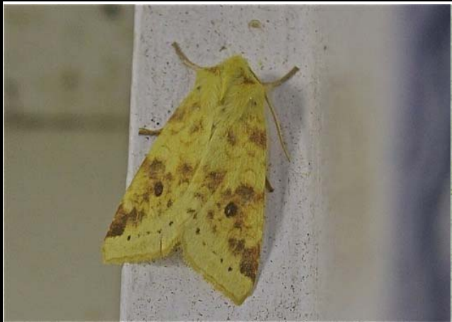
2274 Sallow ( Xanthia icteritia )