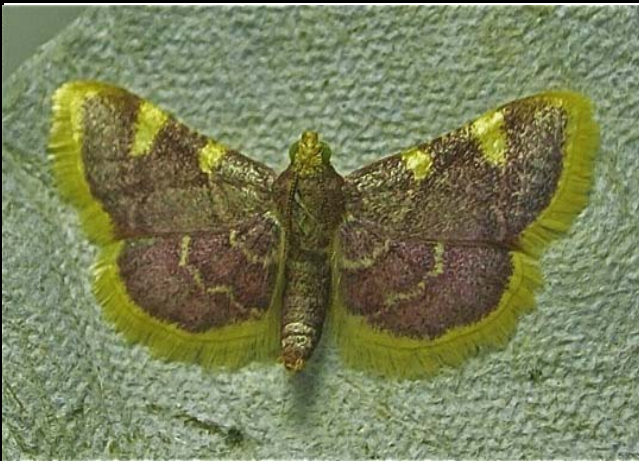
1413 Gold Triangle ( Hypsopygia costalis )