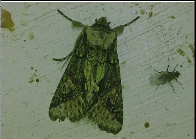
2245 Green-Brindled Crescent ( Allophytes oxyacanthae )