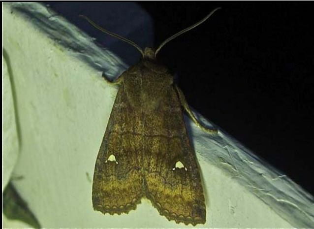
2256 Satellite ( Eupsilia transversa )