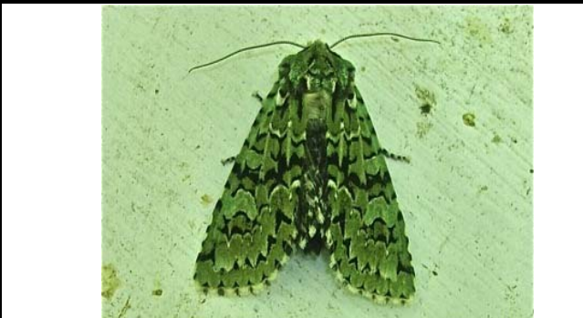
2247 Merveille Du Jour ( Dichonia aprilina )